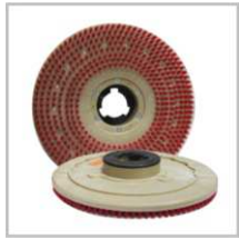
Tufted Stiff Poly Bristle Pad Driver 3/4" long bristles. 3/4" riser. #1007 - 12" #A0018-1 W/R - 13" #A0010-4 - 17" #A0011-3 - 20"