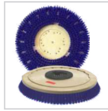
Lite Grit Brush Scrub with flexible blue 150 grit bristles #A0018-1 - 13" #A0038-1 - 15" #A0008-1 - 17" #A0009-1 - 20"