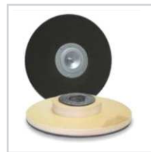
Premium Sandpaper Driver 1" thick plywood block 1" riser and universal clutch plate. 1/2" thick cushion and steel mounting disc holds sandpaper #A0014-HD - 17" #A0014-1HD - 20"