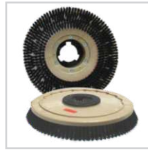
Grit Brush Strip/scrub with stiff black 80 Grit bristles #A0018 - 13" #A0038 - 15" #A0008 - 17" #A0009 - 20"