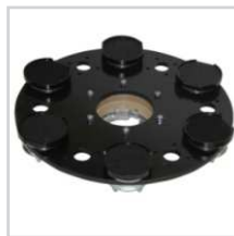
Orbitec Diamond Driver (6) steel mounting cups hold 3" diamond tools. Universal steel clutch plate. #HP0018 - 13" #HP0020-3 - 20"