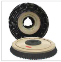
Stiff Poly Scrub Brush For general scrubbing #A0020 - 13" #A0036 - 15" #A0002 - 17" #A0003 - 20"