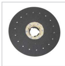
Diamond Pad Driver #A0017DPD - 13" N/A - 15" #A0010DPD - 17" #A0011DPD - 20"