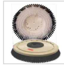
Nylon Carpet Brush Scrub with soft & stiff nylon bristle mix. #A0016 - 13" #A0037 - 15" #A0006 - 17" #A0007 - 20"