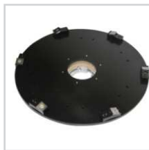
Surface Prep Scraper (6) replaceable Tungsten Steel Scraping Heads, bolt to steel drive plate. Universal steel clutch plate. #HP0034 - 13" #Hp0034 - 20"