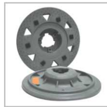
Hawk Lok™ Pad Driver Molded design with universal clutch plate, built-in riser and a triangular showerfeed system handles the toughest jobs. #0034-4 - 15" #A0010-5 - 17" #A0011-4 - 20"