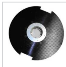
Weighted Diamond Pad Driver Steel pad driver block adds up to 64 lbs of pressure. Molded pins securely hold pads for HD floor prep. #A0017WTDPD - 13" (25#) #A0010WTDPD - 17" (46#) #A0011WTDPD - 20" (64#)