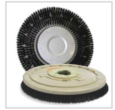
Hawk Spin Safe Carpet Brush w/Adjustable S/S Glide Plate Smooth adjustable plate protects the carpet. #A0013-17 - 17" #A0013-20 - 20"