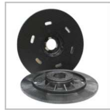
Premium Double Hook Pad Driver Molded polymer pad face has hundreds of individual hooks that securely grip and hold pads. Riser and showerfeed block #A0017 - 13" #A0034 - 15" #A0010 - 17" #A0011 - 20"