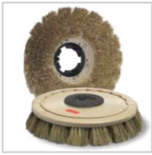
Tampico Polishing / Scrubbing Brush #A0021 - 13" #A0035 - 15" #A0004 - 17" #A0005 - 20"