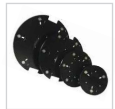
Hawk Claw Diamond Tool Driver with steel clutch plate #CLAW10 - 10" #CLAW13 - 13" #CLAW15 - 15" #CLAW17 - 17" #CLAW20 - 20"