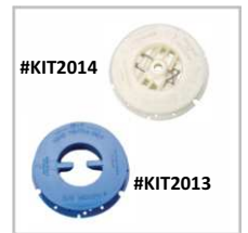
Pad Centering Clamp - 2-Piece 2-piece clamp clips together securely holding any size pad. #KIT2013 - Screw Lock #KIT2014 - Spring Lock

*Rotary brush blocks are 2" smaller than machine size. Rotary pad driver blocks are 1" smaller than machine size. All have Universal clutch plate.